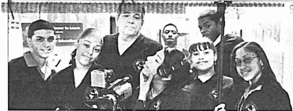
Printing imperfections present during scanning